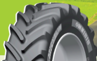
Pressure (bar) and (psi) - Load per tyre in kg (3) - (4) - (5)