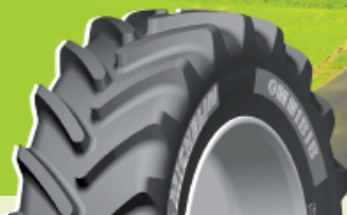
Pressure (bar) and (psi) - Load per tyre in kg (3) - (4) - (5)