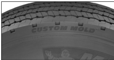
Custom Mold™ X® LINE ENERGY D

Seamless, Splice-less, New Tire Appearance