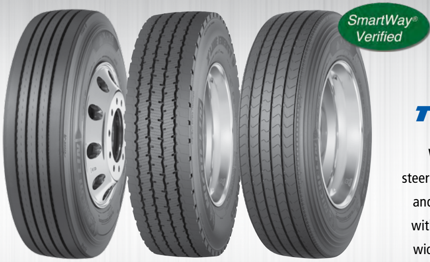
MICHELIN® X® Line™ Energy Z