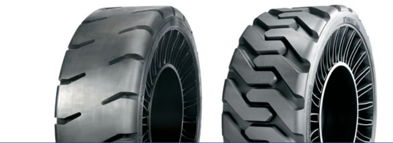
MSPN 45604 / CAI 976836 Hard Surface Traction