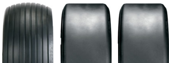
13" Grooved Polyresin Tread