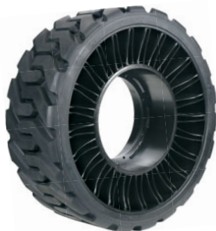
2-Piece Hub X TWEEL SSL shown without a hub adapter installed