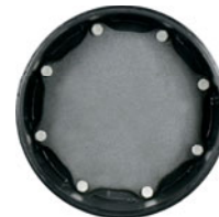
Hub Adapter MSPN 47999 CAI 336959 12 mm thick 1015 carbon steel / reversible Blank for custom applications, including a specific bolt configuration not identified here