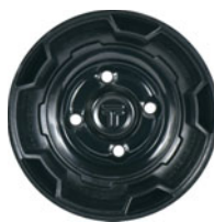
MSPN 01133 Golf cart hub (includes center dust cap)