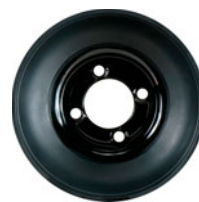
MSPN 78245 Utility cart hub (shown above)