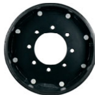
Hub Adapter MSPN 47868 CAI 291074 12 mm thick 1015 carbon steel / reversible 6.0" (152.4 mm) center dia. 8 x 8.0" bolt pattern 0.67" (17 mm) bolt holes, tapered Use adapter to change offset on 8 x 8.0" standard fitment size