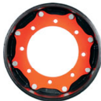
Hub Adapter MSPN 47462 CAI 481115 12 mm thick 1015 carbon steel / reversible 9.0" (228.6 mm) center dia. 8 x 10.75" bolt pattern 0.67" (17 mm) bolt holes, tapered Fits some Bobcat machines