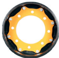
Hub Adapter MSPN 47139 CAI 419992 12 mm thick 1015 carbon steel / reversible 8.75" (222.3 mm) center dia. 8 x 10.91" bolt pattern 0.79" (20 mm) bolt holes, no taper Fits front of Case backhoe loader machines