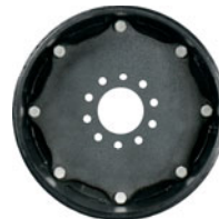
Hub Adapter MSPN 04630 CAI 336820 12 mm thick 1015 carbon steel / reversible 3.68" (93.5 mm) center dia. 10 x 140 mm bolt pattern 0.63" (16 mm) bolt holes, tapered Fits some truck mounted forklifts