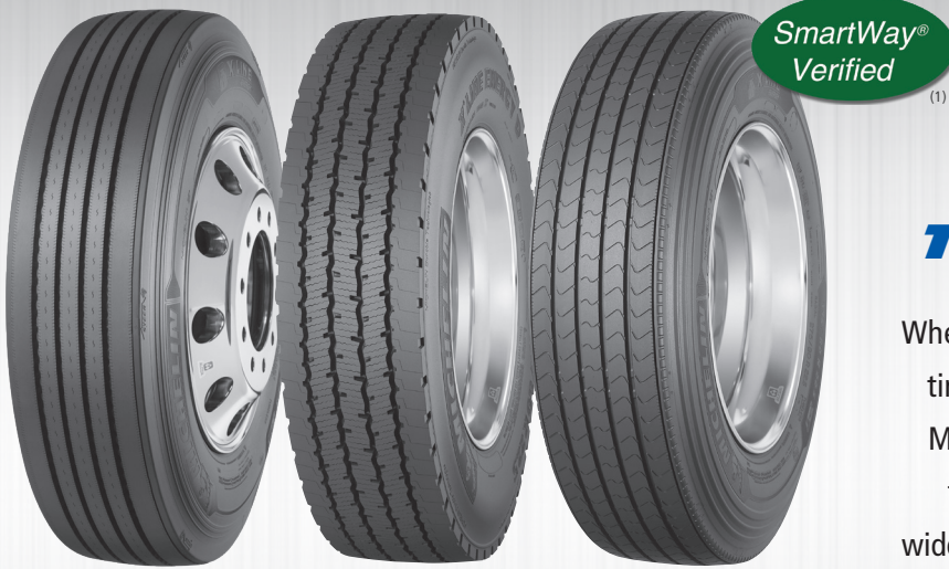
MICHELIN® X® Line Energy Z