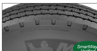
New Tire X® LINE ENERGY D