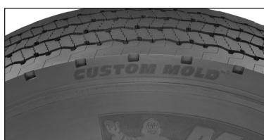
Custom Mold X® LINE ENERGY D

Seamless, Splice-less, New Tire Appearance