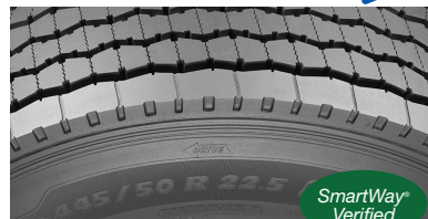
New Tire X ONE® LINE ENERGY D Directional (4)