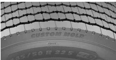
Custom Mold X ONE® LINE ENERGY D Non-Directional