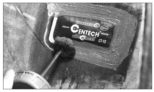
To cover over-buffed areas in tubeless tires, apply Security Sealer to the outer edge of the repair unit and over-buffed area. If tube-type, cover the repair with Tire Talc to prevent the repair from vulcanizing to the tube.