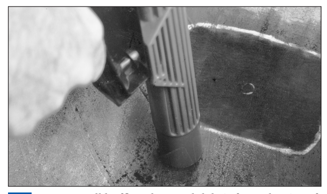
Vacuum all buffing dust and debris from the tire. If the buffed surface is touched or contaminated after cleaning the area, you must repeat Step 11 to guarantee your surface is clean for proper repair bonding.