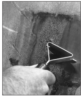
Apply rubber cleaner to the inner liner at the injured area. While the area is still moist, use a rubber scraper to remove contaminating substances.