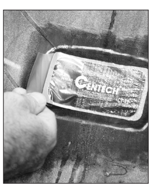
Remove the rest of the poly backing. Stitch the repair unit from the center to the outer edges. Remove the top clear protective poly.