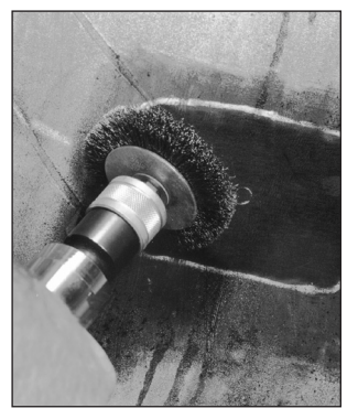
Use a low rpm (max. 5000 rpm) buffer and texturizing wheel to mechanically buff the stem flush to the inner liner. Then buff the outlined area to achieve an even RMA-1 or RMA-2 buffed texture. Use a clean, soft wire brush, remove all dust and debris from the buffed area.