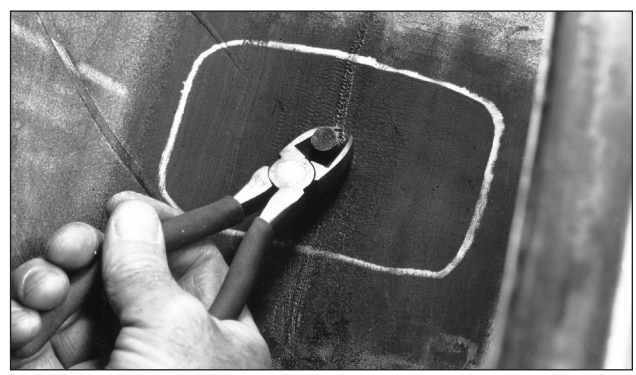
Remove the template and cut off the stem 1/8 inch (3 mm) above the inner liner on the inside of the tire. NOTE: If you do not have a repair template, go to this step and cut the stem; then using the correct sized patch and centering it correctly on the injury – arrows towards the beads – draw your perimeter approximately 1/2 inch larger than the repair patch.