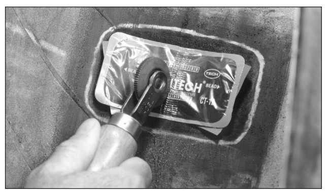
Stitch the repair unit, firmly pressing down from the center toward the outer edges. This will eliminate trapping air under the repair unit.