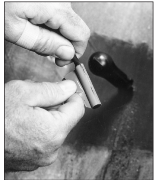
Place the wire puller in the middle of the black exposed portion of the stem. Remove the protective poly from the stem and brush a light coat of Chemical Vulcanizing Fluid (cement) on this area. For lubrication, apply a coat of cement to the wire puller where it contacts the stem.