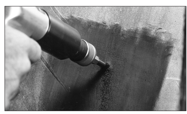
Prepare the injury with the proper size carbide cutter on a low rpm drill (max. 1200 rpm). Following the direction of the injury, drill from the inside out. Repeat this process three times. Repeat this procedure from the outside of the tire to ensure damaged steel and rubber are removed (be careful when drilling; you do not want to make the injury any larger than necessary).