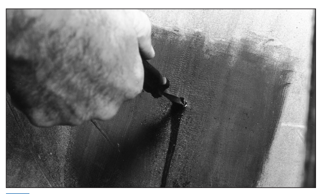
Using a Spiral Cement Tool, cement the injury from the inside of the tire with Chemical Vulcanizing Fluid. Turn the tool in a clockwise direction both into and out of the tire. This step should be repeated 3 to 5 times. Leave the tool in the injury as you go to the next step.