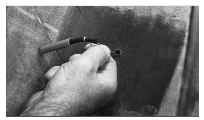
Remove spiral cement tool from the injury and feed the small end of the wire puller through the injury from inside of the tire.