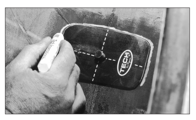
On the inside of the tire, center the appropriate repair unit template over the stem, make sure to correctly align the template in relationship to the tire beads, and draw a perimeter around the template.