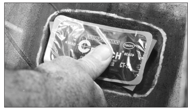
With the tire beads in a relaxed position, center the repair unit over the filled injury. Press the repair unit down into place over the injury. Make sure the directional bead arrows on the repair unit are aligned with the beads of the tire, and press into place. Roll the protective poly back to the outer edges of the repair unit. This enables you to handle the repair unit without contaminating the bonding gum layer. You are now ready to stitch the repair.