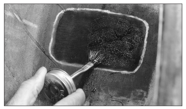
Using Chemical Vulcanizing Fluid (cement), brush a thin, even coat into the clean textured area. Allow 3 to 5 minutes to dry; the vulcanizing cement should be tacky. Areas with high humidity may require a longer dry time. Make sure the cement used is compatible with the repair units you are installing.