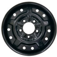
MSPN 49265 & 10545