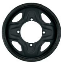
MSPN 75085 & 82599