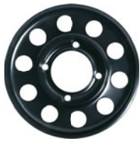
MSPN 21709 & 29242