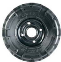
MSPN 68495, 67693, 65492, 64998 & 03488

Product measurements are subject to change and are listed here for your convenience. Please see your MICHELIN representative for up-to-date data.