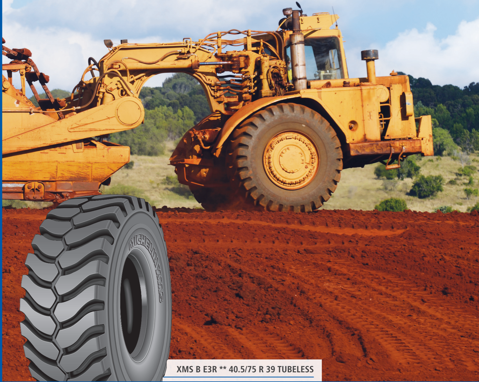
XMS B E3R ** 40.5/75 R 39 TUBELESS

E3 RADIAL TIRE FOR LARGE SCRAPERS DELIVERS EXCELLENT TRACTION, SUPERIOR DAMAGE RESISTANCE AND A SMOOTH RIDE