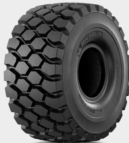
MICHELIN XTRA DEFEND 65 SERIE