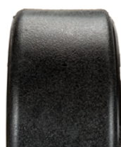
13" Smooth Polyresin Tread