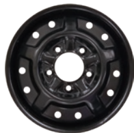
MSPN 49265 & 10545

Note: All UTV/ATVs use 60° / Conical / Tapered Lug Nuts.