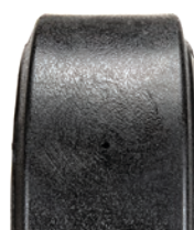
15" Smooth Polyresin Tread