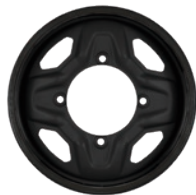
MSPN 75085 & 82599