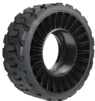
2-Piece Hub X TWEEL SSL shown without a hub adapter installed