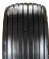
13" Grooved Polyresin Tread