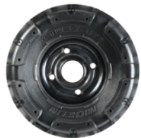
MSPN 68495, 67693, 65492, 64998 & 03488