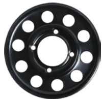
MSPN 21709 & 29242