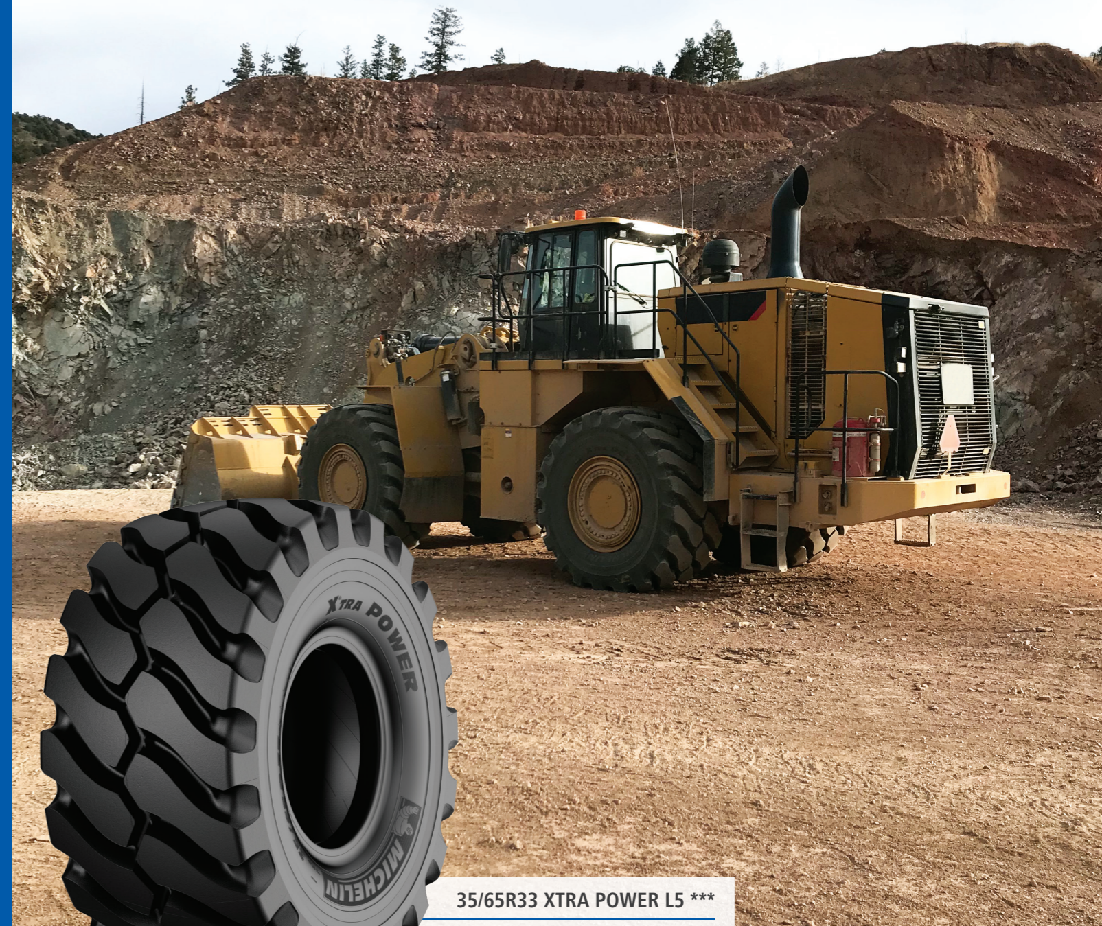
35/65R33 XTRA POWER L5 ***