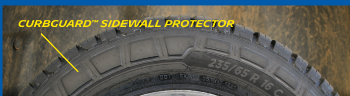
Michelin Agilis CrossClimate C-Metric