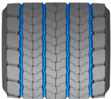
New - 21/32nds