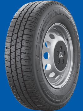
Agilis CrossClimate 2