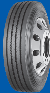
Agilis HD Z