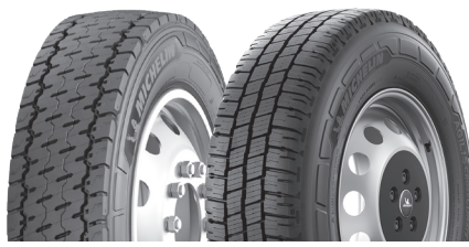
Agilis HD A/S Agilis CrossClimate 2