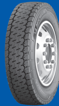
Agilis HD A/S