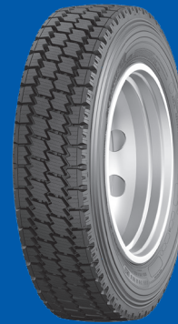
Agilis HD Grip D