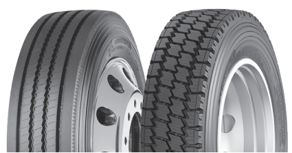
Agilis HD Z Agilis HD Grip D

Proper maintenance directly impacts tire life and performance. Please ensure the recommended air pressure is kept and rotations are done at the proper intervals.