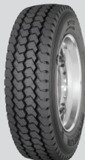
X ® WORKS™ HD Z