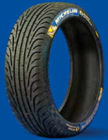
FW3 (FULL WET)

Size: 20/65-18 Conditions: icy, frosty, damp, cold conditions