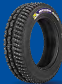
X-ICE NORTH 3

Size: 15/65-15 Conditions: ice and/or snow