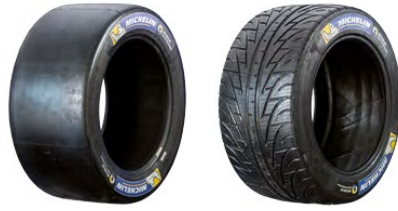
SLICKS SOFT, MEDIUM, HARD