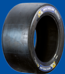
SLICK MEDIUM - HARD