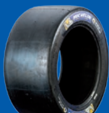
SLICK SOFT - MEDIUM - HARD