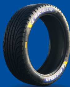
FW3 (FULL WET)

Size: 20/65-18 Conditions: icy, frosty, damp, cold conditions