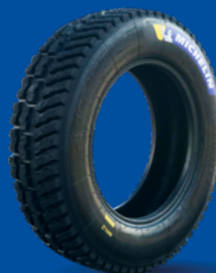
X-ICE NORTH 3

Size: 15/65-15 Conditions: ice and/or snow