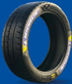
H5 (HARD COMPOUND)