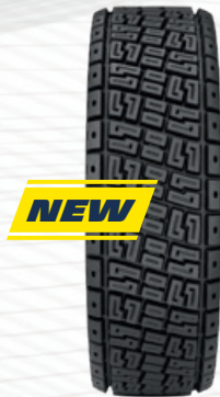
LTX FORCE T