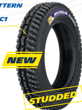
PILOT ALPIN NA01