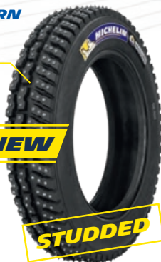
PILOT ALPIN NA01