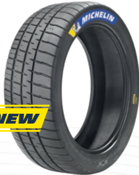
PILOT SPORT A MW1