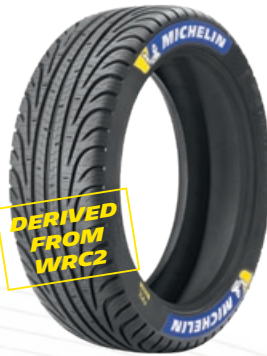
PILOT SPORT FW3