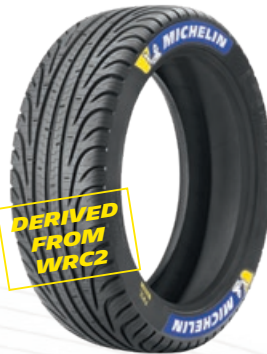
PILOT SPORT FW3