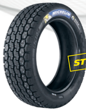
PILOT ALPIN NA01