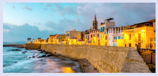
70% of Alghero's fortifications still stand

Sardinia is one of Italy's four autonomous regions