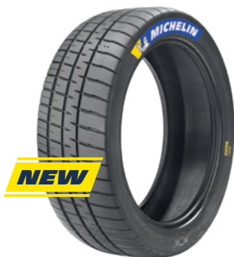
PILOT SPORT A MW1