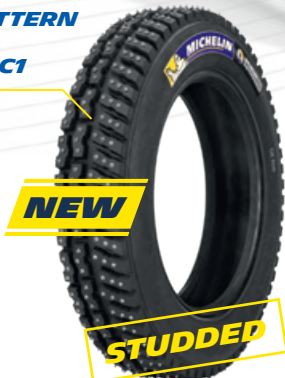
PILOT ALPIN NA01