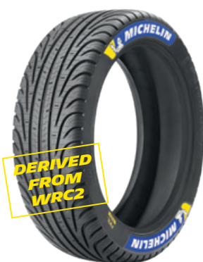
PILOT SPORT FW3