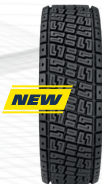
LTX FORCE T