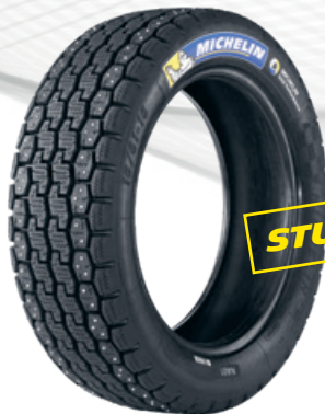
PILOT ALPIN NA01