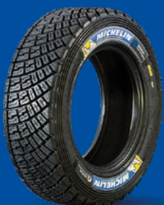
H4 (HARD COMPOUND)

Size : 17/65-15 Conditions: rough, rocky, abrasive surfaces