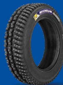
X-ICE NORTH 3

Size : 15/65-15 Conditions: ice and/or snow