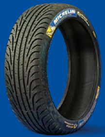
FW3 (FULL WET)

Size : 20/65-18 Conditions: icy, frosty, damp, cold conditions