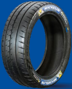
H5 (HARD COMPOUND)