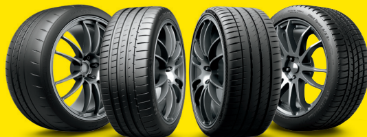
THE MICHELIN® PILOT® SPORT CUP 2 TIRE

WITH THE MICHELIN® PILOT® FAMILY OF TIRES