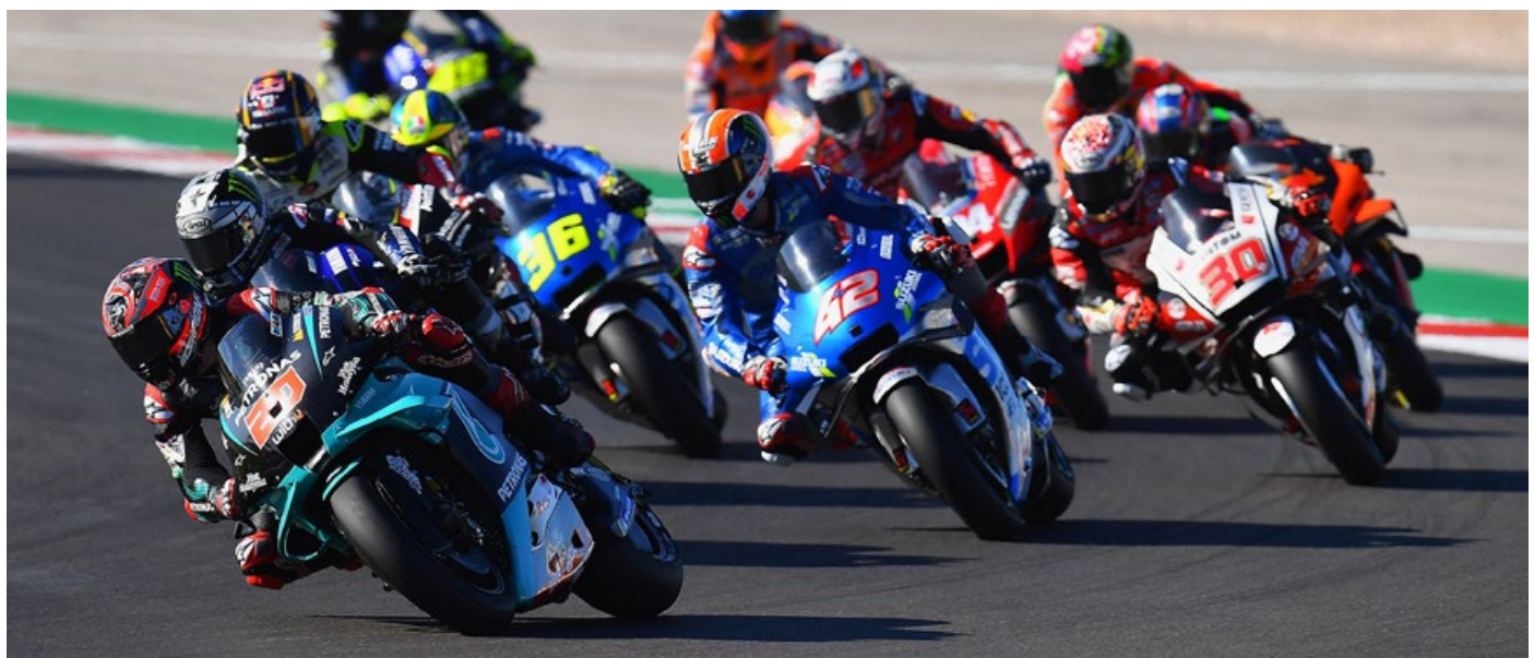
MIGUEL OLIVEIRA RED BULL KTM TECH 3 Winner, pole position and best race lap Grande Prémio Meo De Portugal 2020

“ The race was good, we were one of the few riders to choose the MICHELIN Power Slick hard front. I have no complaints about the rear tyre at all, and it has been a perfect weekend for me.