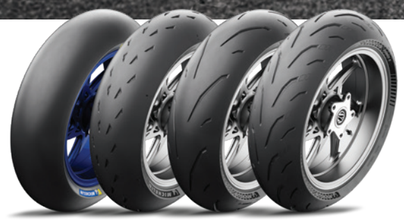
From left to right, MICHELIN Power MotoGP™, MICHELIN Power Cup², MICHELIN Power 6P², MICHELIN Power 6